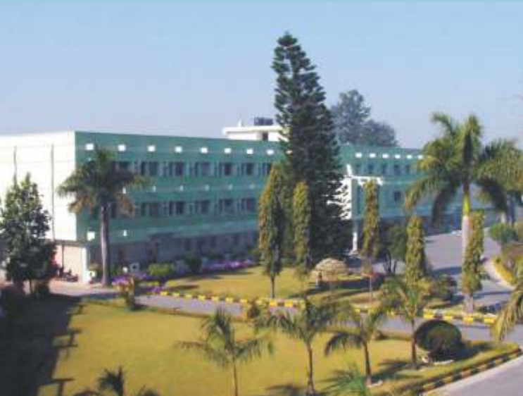
Indian Institute of Remote Sensing (IIRS) Campus, Dehradun