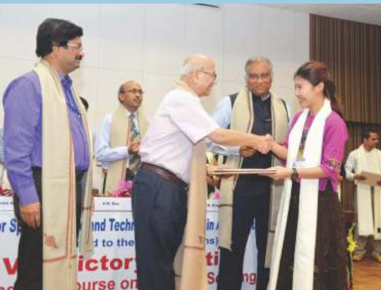
Prof. U.R. Rao, former Chairman ISRO, distributing certificates to short course participants