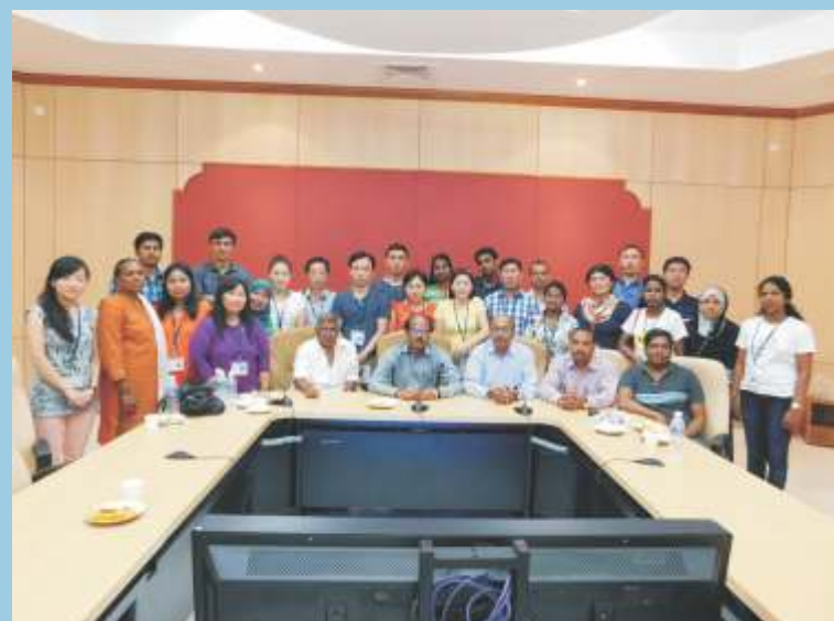
Course participants at SHAR during their educational visit to SHAR