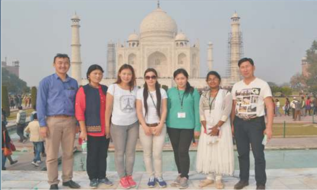
Course participants during their educational visit to Taj Mahal, Agra