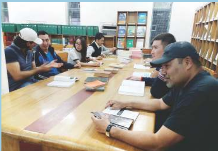
Library Facilities at IIRS, Dehradun