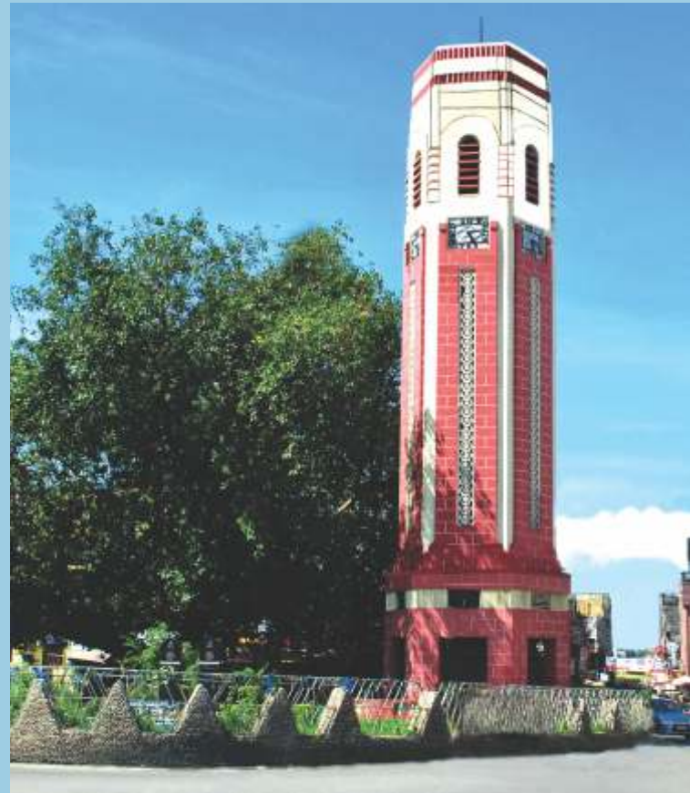
Dehradun City, Clock Tower

Alumni meets are organized to develop a network and to establish meaningful linkages between CSSTEAP, faculty and its past students. These are aimed to provide common platform to interact and apprise about the latest development in the space technology and its applications. Such meets were held in Nepal, Bangladesh, Sri Lanka, Bhutan and Myanmar in the past. The centre proposes to hold 2-3 such meetings in coming years in different countries with local support.