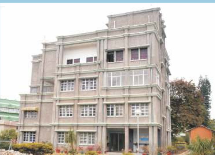
CSSTEAP Headquarters at Dehradun