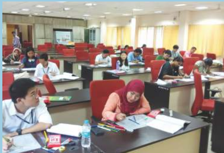
Students during their practical classes

To download application form or to know more about CSSTEAP, its past and future programmes, list of participants and countries who have benefitted from these and the Pilot Projects carried out through these programmes, please visit us at www.cssteap.org