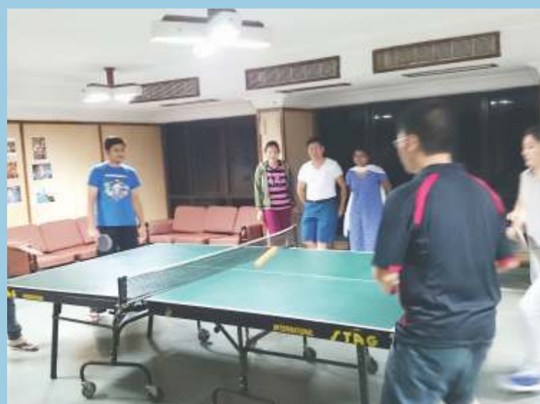
Indoor sports facility at IIRS, Dehradun