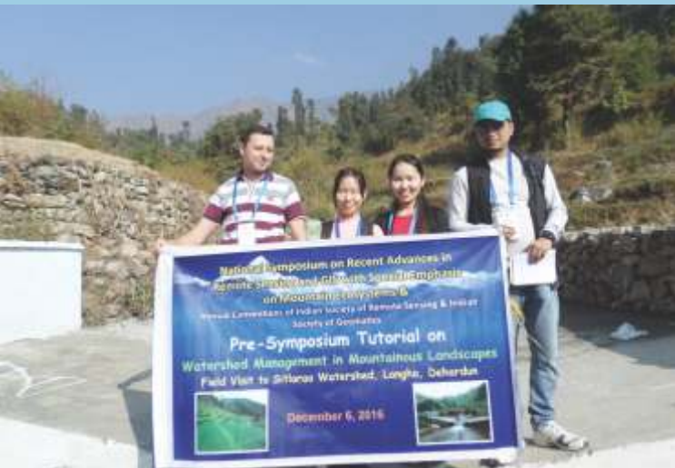
Course participants of CSSTEAP during the field visit for Pre-Symposium Tutorial on Watershed Management in mountain landscape at IIRS