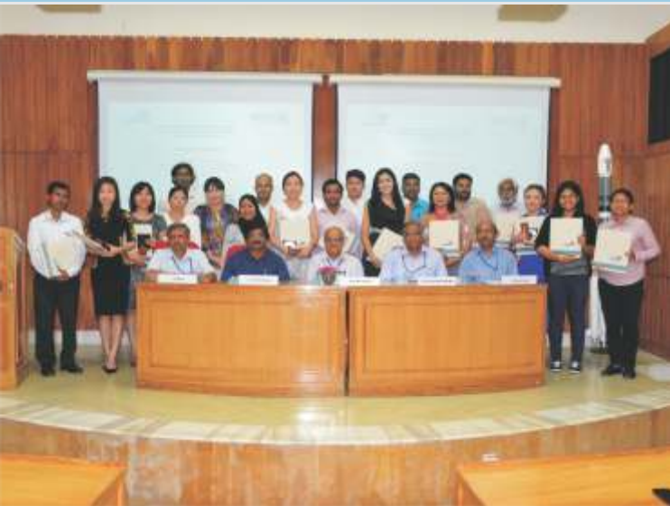
Prof U.R. Rao, Former Chairman, ISRO and Distinguish Professor ISRO distributing Diploma certificates to the participants

UNOOSA, Vienna, UNSPIDER, Beijing and UN-ESCAP, Bangkok have been providing financial assistance to CSSTEAP educational programmes and have extended travel grants to a good number of course participants since its inception. This contribution by UN Agencies is highly supportive to the overall activities of the Centre. The prospective candidates may contact UNESCAP Bangkok to request for sponsorship.