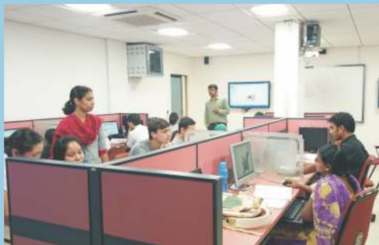
Students of 20 th RS&GIS course during practical exercise

(ii) Master programme: This programme gives an opportunity and continuity in developing higher research skills for those who have completed successfully the 9 months P.G. Course. This is subject to qualifying the admission requirements of Andhra University, India. A research project by the scholars is conducted and executed in their respective countries with