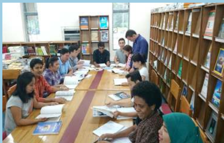
Students of 20 th RS & GIS course in Library