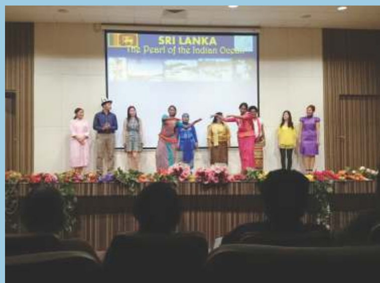
Course participants during cultural programme

Phase-I of RS and GIS Course is divided into two Semesters. Semester-I is of 4 months duration and consists of module-I covering RS, image interpretations and analysis, Photogrammetry, GPS, GIS, advance DIP, RS & GIS and environmental assessment & monitoring. Semester-II is of 5 months duration and consists of two modules, module-II of 2 months with a focus on application of RS and GIS in thematic disciplines namely, Agriculture and Soil; Forest Ecosystem Assessment & Management; Geosciences & Geohazards; Marine & Atmospheric Science; Water Resources; Urban & Regional Studies; Satellite Image Analysis & Photogrammetry and Geoinformatics. In module-III of 3 months duration each scholar has to formulate and execute a Pilot Project under the guidance of the faculty. These three modules are described briefly ahead.