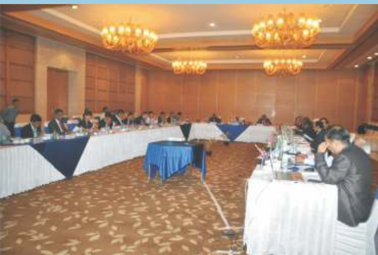
Mr. A.S. Kiran Kumar, Chairman, ISRO and Chairman CSSTEAP GB alongwith GB members during 20 th GB meeting