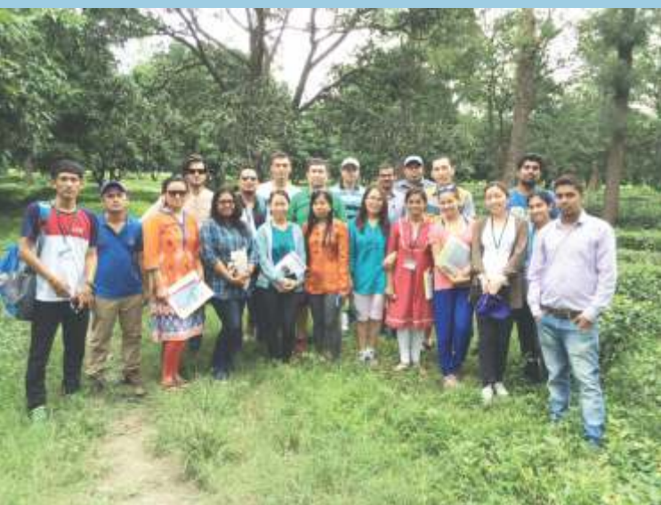
21 st RS & GIS course participants during field visit to Barkot Forest Rangenear Rishikesh