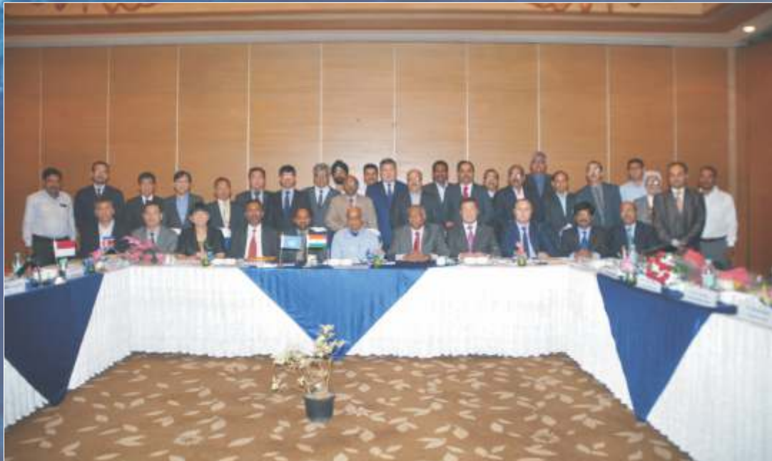
Governing Board Members and Special Invitees during 20 th G.B. Meeting in New Delhi on November 16, 2015