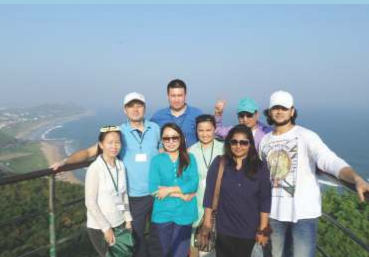
CSSTEAP students during their educational visit at Vishakhapatnam