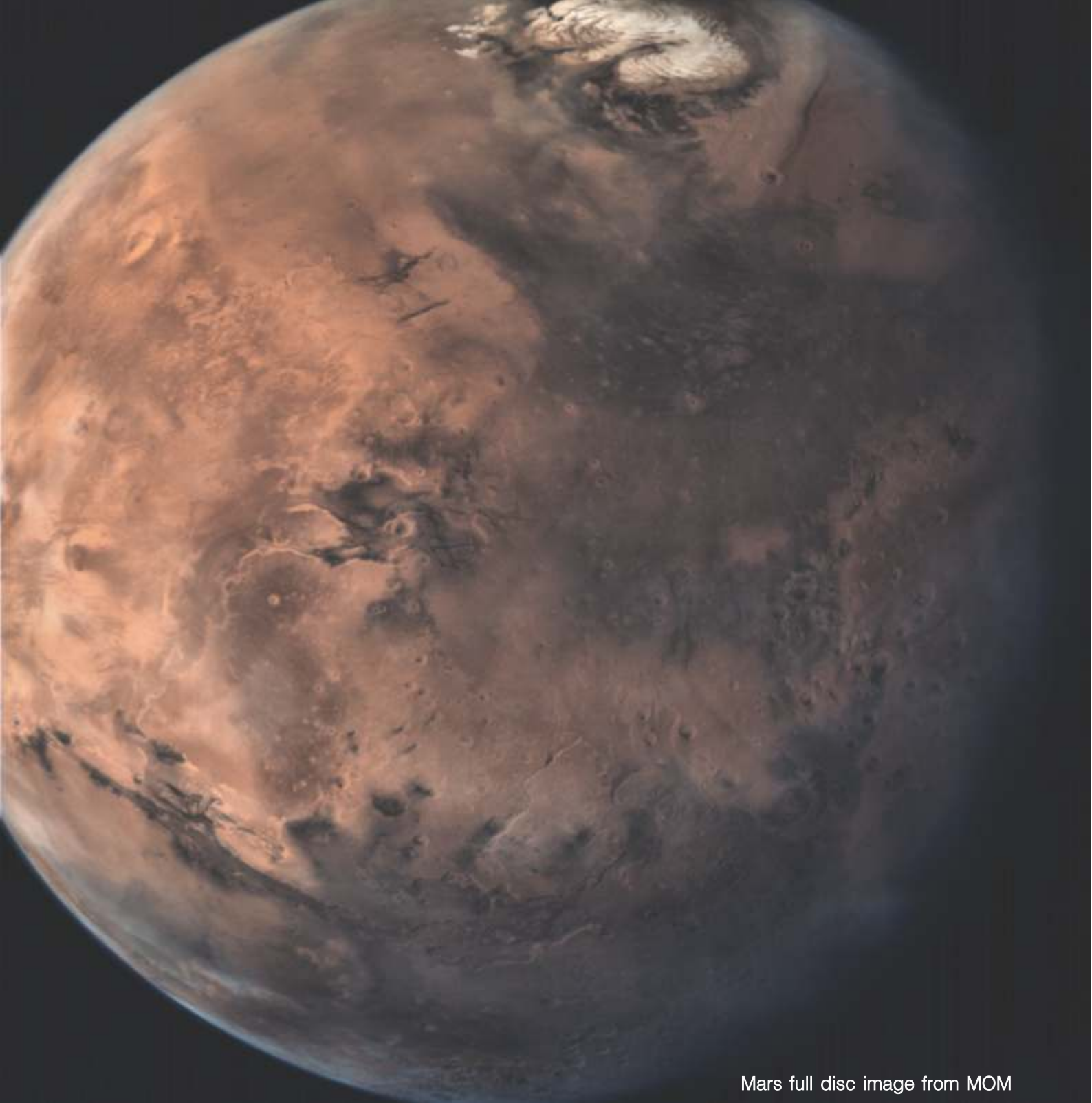
Mars full disc image from MOM