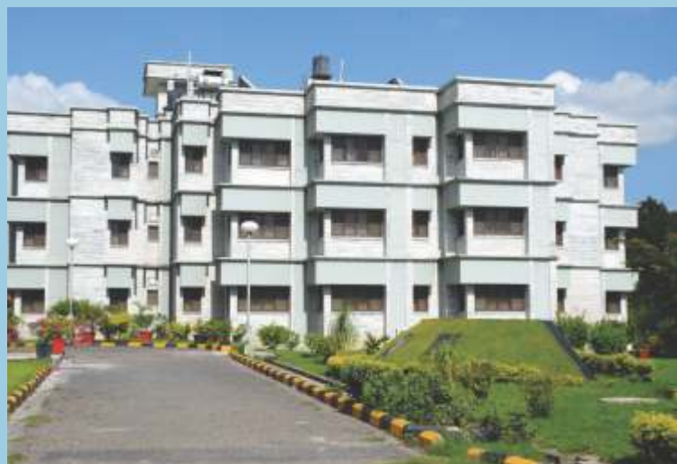
International Hostel at IIRS Dehradun