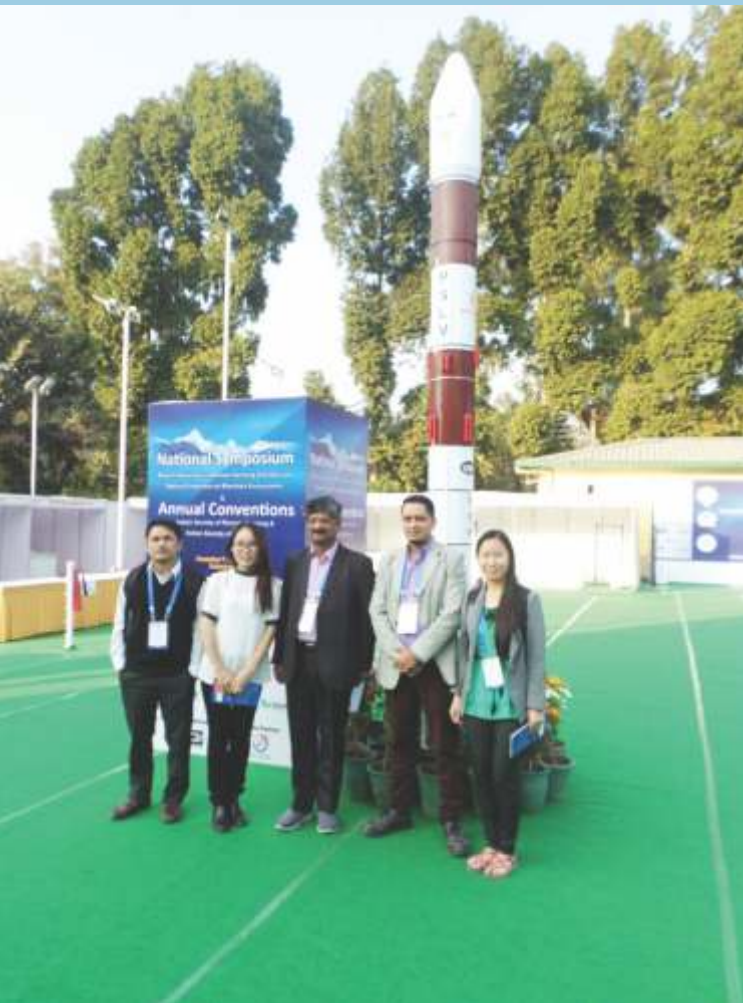
Students of 21st RS&GIS course during ISRS-IG National Conference at IIRS, Dehradun