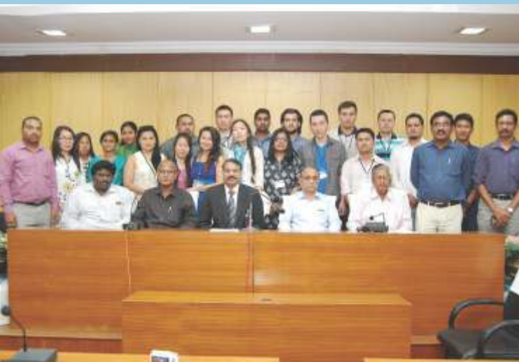
Course participants with Vice Chancellor, Andhra University, Vishakapatnam