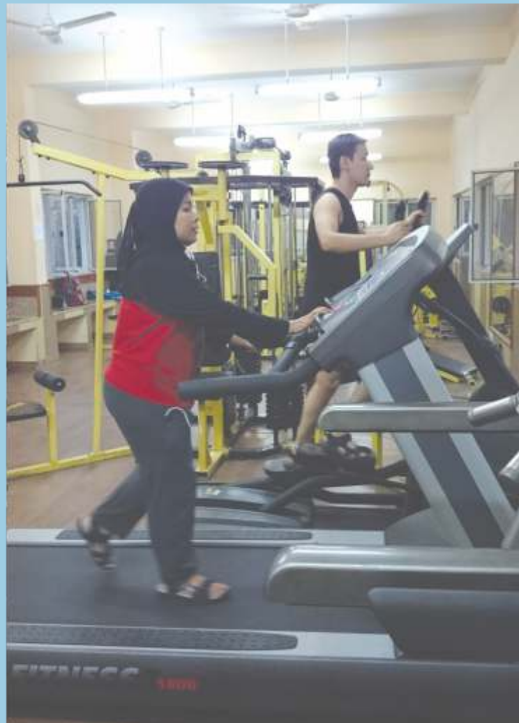
Students at Gym

As a part of the course curriculum, the participants will have the opportunity to visit different centres of ISRO / Dept. of